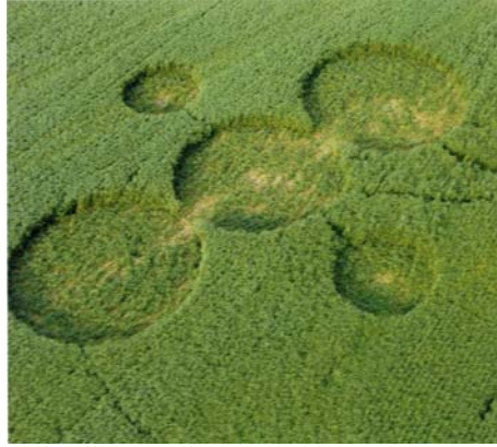
Geneseo, Illinois 2006