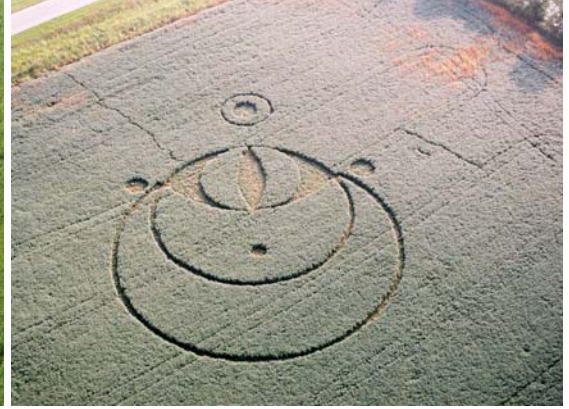
Locust Grove, Ohio 2003

The 5th Annual ICCRA Pre-season Crop Circle Meeting (2008 Season) for all interested crop circle researchers will take place starting at 3 pm, May 9 th , 2007 through noon, May 11 th , 2007 at Woodland Altars , located 7 miles northeast of The Great Serpent Mound State Memorial in Locust Grove, Ohio. Woodland Altars is located in an area that is central to the locations of several recent authentic crop circles in Ohio: Locust Grove (near Serpent Mound), Bainbridge (near Seip Mound), West Union, Miamisburg (near the Miamisburg Mound), Rarden, Hillsboro, and Fairfax. Woodland Altars is also centrally located to many other ancient Native American sites including: Serpent Mound, Fort Hill, Fort Ancient, Mound City, Leo Petroglyphs , the Miamisburg Mound and many more.