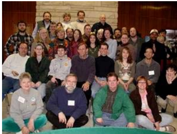
A Group Photo from the 1 st Annual ICCRA Meeting

The ICCRA meeting is designed to be all-volunteer and at cost - meaning the lowest possible price for everyone involved.