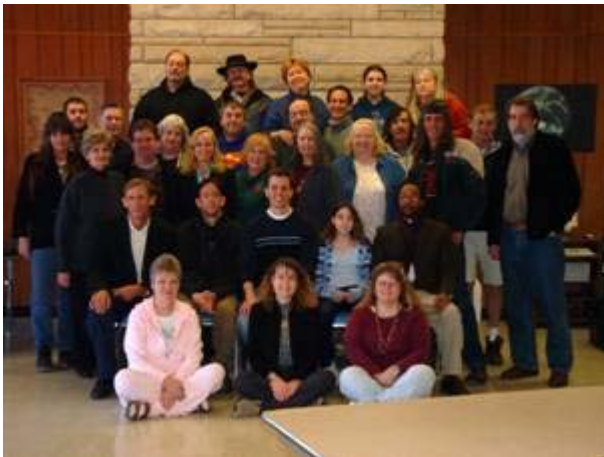
A Group Photo from the 2 nd Annual ICCRA Meeting