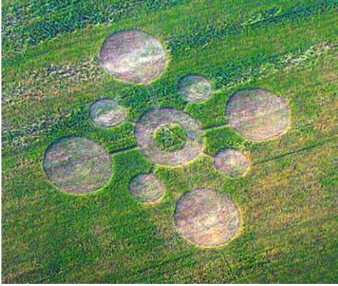
Madisonville, Tennessee 2007